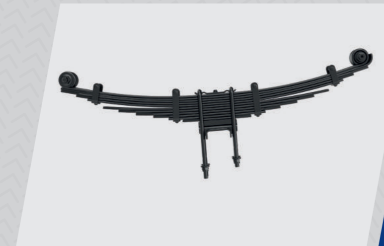
Grease free suspension