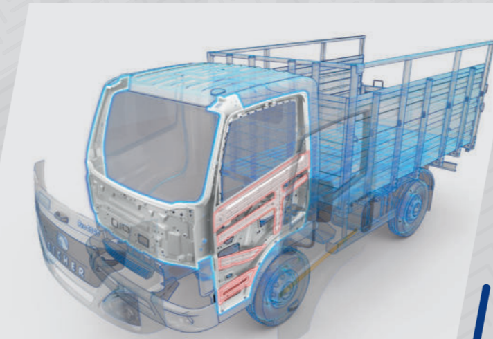
Dual panel cabin