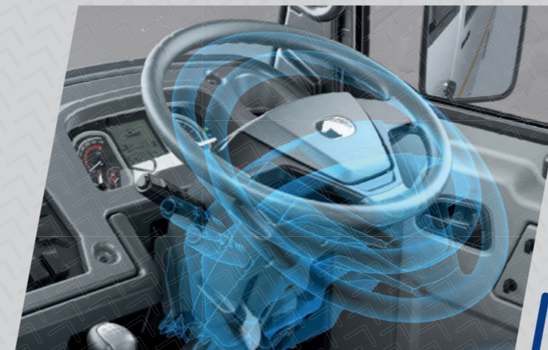
Tilt & telescopic power steering