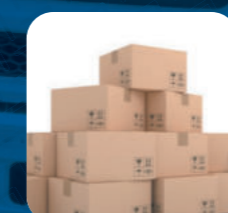
Parcel & Courier