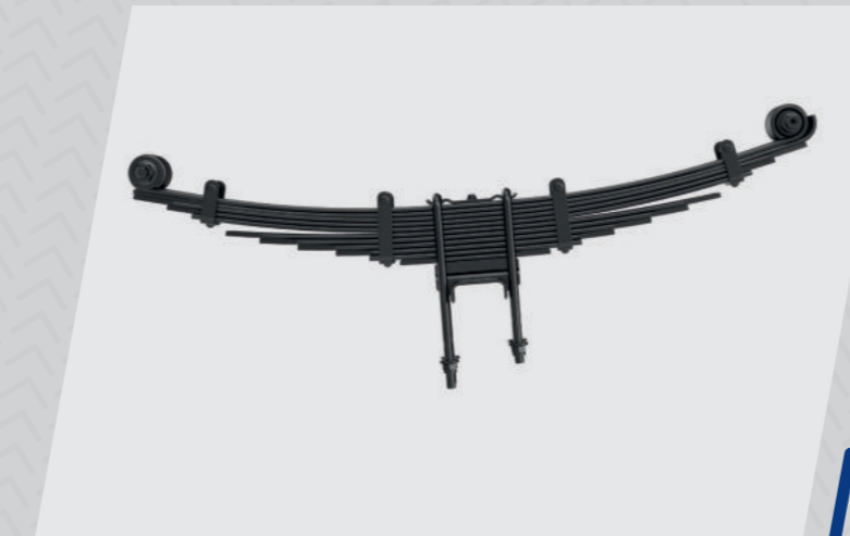
Grease free suspension