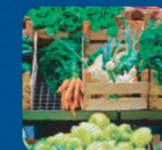
Fruits & Vegetables