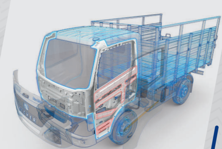
Dual panel cabin