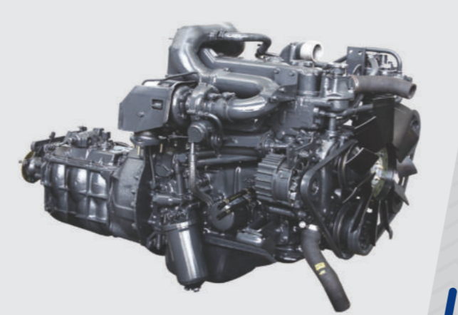
Eicher proven E483 engine

Eicher Pro 2070 provides one with best-in-class mileage and revolutionary driver comfort. Its next-gen technology is ahead of the curve for years to come. The Pro 2070 promises to make your business profitable.