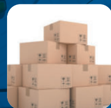
Parcel & Courier