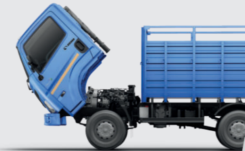
1.8m narrow & tiltable cabin