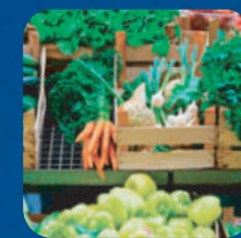
Fruits & Vegetables