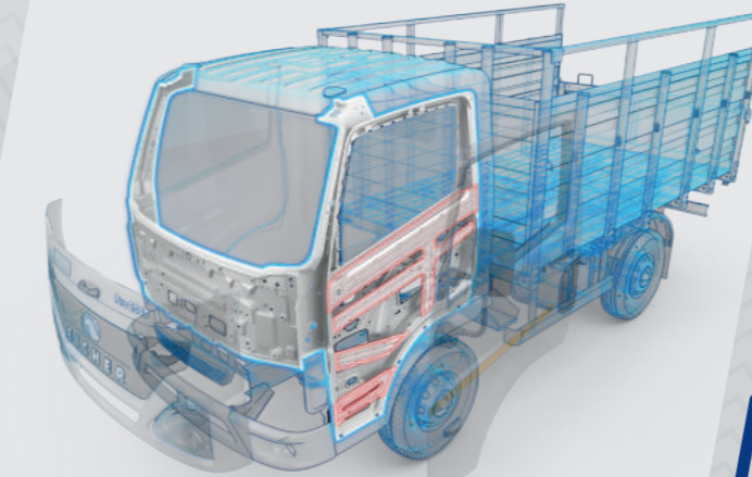
Dual panel cabin