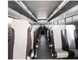
Maximum number of seats in its category- More revenue