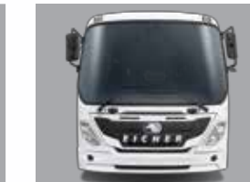
Sleek integrated head lamps- Stylish and contemporary