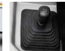
Hybrid Gear Shifting Linkage- Ease of gear shifting