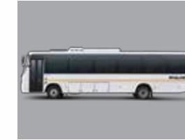
Robotic painting- High gloss-95% and DOI-7-Excellent fit and finish