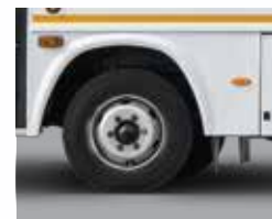
Radial Tubeless tyres- Better ride comfort, mileage and puncture resistant