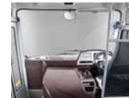
Attractive and ergonomically designed driver area - Driver comfort