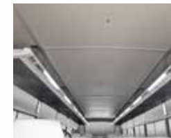
High intensity LED saloon lamps-integrated with hatrack - More space, better aesthetics and illumination