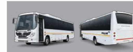
Attractive front and rear styling- Exemplary looks