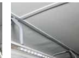
PVC molded roof lining- Attractive and easy to maintain