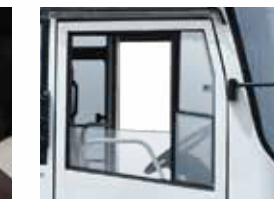
Quarter glass window- Proper ventilation for driver