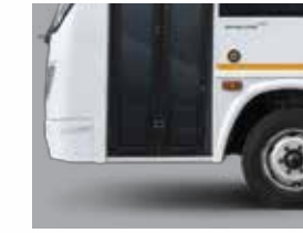
Lowest floor height in its category- Ease of embarking and disembarking