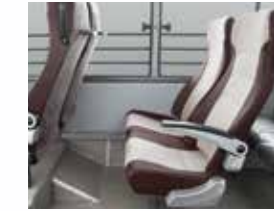
Bucket type HHR seat with body profiling- Higher passenger comfort