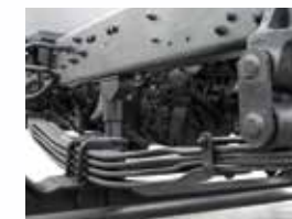
Parabolic suspension- Better ride comfort