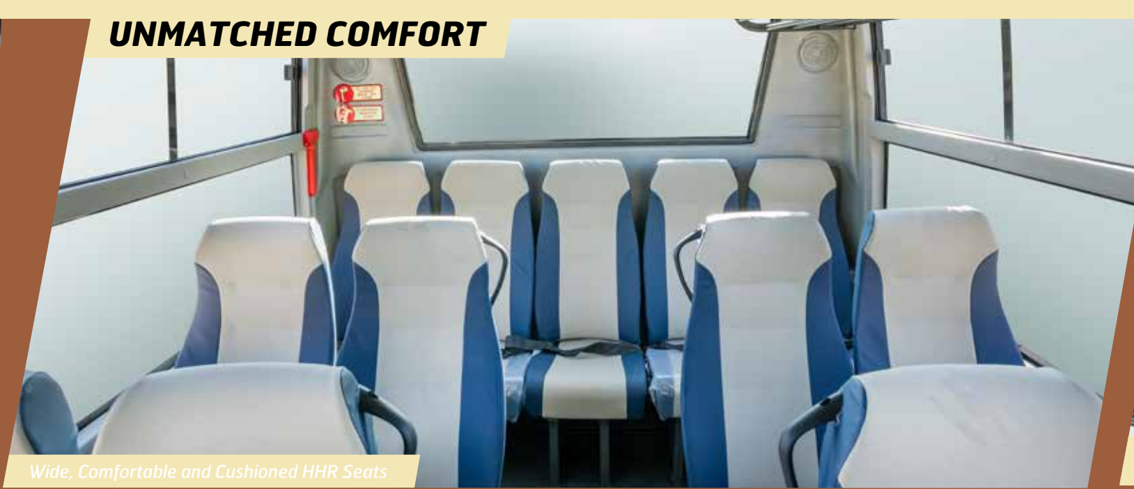
Wide, Comfortable and Cushioned HHR Seats