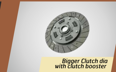
Bigger Clutch dia with clutch booster