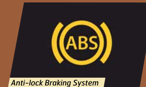
Anti-lock Braking System