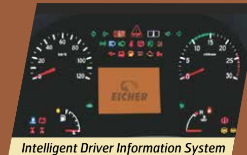
Intelligent Driver Information System