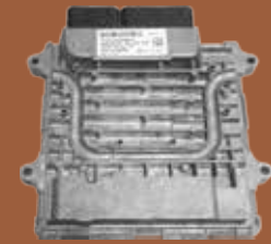
Volvo group's Engine Management System (EMS)