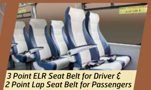
3 Point ELR Seat Belt for Driver & 2 Point Lap Seat Belt for Passengers