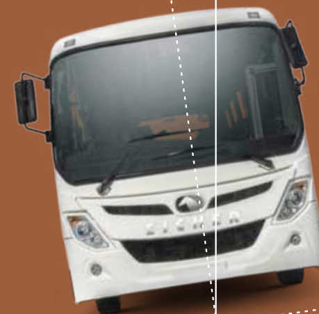
Roll-over Test Compliant