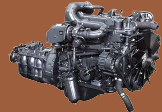
New Generation E494, 4-cylinder CRS Engine with Advanced Fuel Injection Technology & EPS