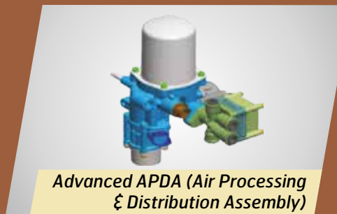
Advanced APDA (Air Processing & Distribution Assembly)