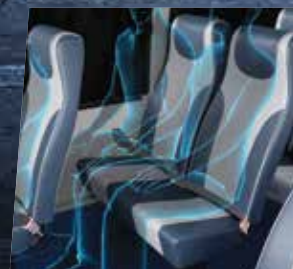
3 POINT ELR SEAT BELT FOR DRIVER and 2 POINT LAP SEAT BELT FOR PASSENGERS