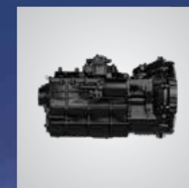
6-SPEED GEARBOX WITH OVERDRIVE