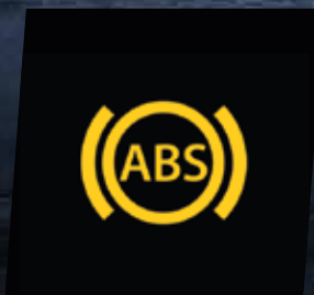
ANTI-LOCK BRAKING SYSTEM