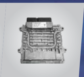
VOLVO GROUP'S EMS