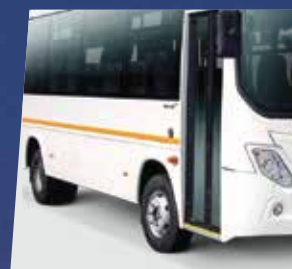
FULL SIZE PASSENGER DOOR