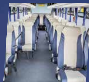
MOST SPACIOUS IN THE CATEGORY