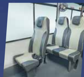
COMFORTABLE LEG ROOM