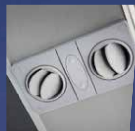
POWERFUL AIR CONDITIONING