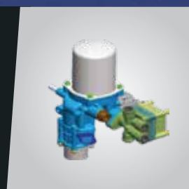
ADVANCED APDA (AIR PROCESSING & DISTRIBUTION ASSEMBLY)