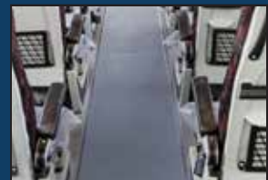
Anti Skid Floor Mat