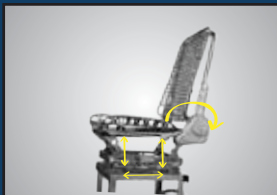
3 point seat Belts