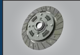
Clutch with 380 mm diameter with booster