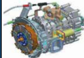
6-speed Overdrive Gearbox