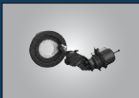
Safer Braking with Air Brakes