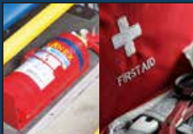
Fire Extinguisher & First Aid