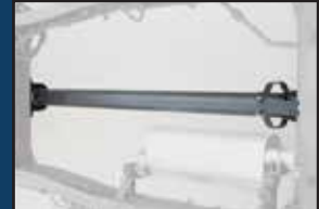
Maintenance Free Monotron Propeller Shaft