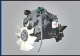
6-cylinder Reliable Mechanical Engine