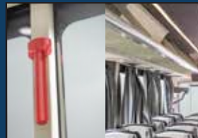
Roof Hatch & Emergency exit