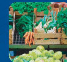
Fruits & Vegetables