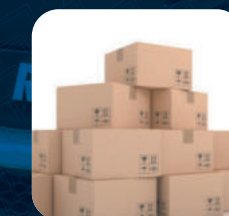
Parcel & Courier

VE COMMERCIAL VEHICLES A VOLVO GROUP AND EICHER MOTORS JOINT VENTURE eichertrucksandbuses.com, Eicher Care: 1800 102 3531