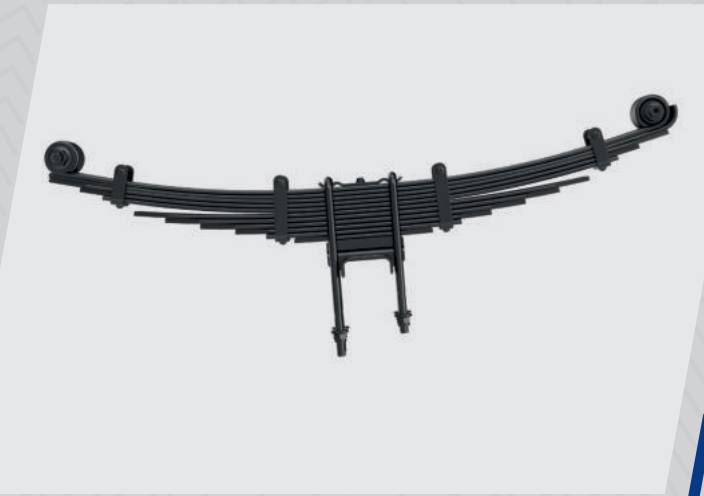
Grease free Suspension