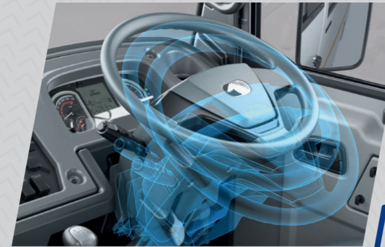
Tilt & telescopic power steering