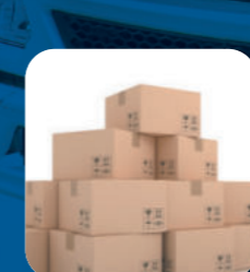
Parcel & Courier

VE COMMERCIAL VEHICLES A VOLVO GROUP AND EICHER MOTORS JOINT VENTURE eichertrucksandbuses.com, Eicher Care: 1800 102 3531