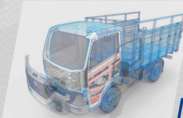
Dual panel cabin