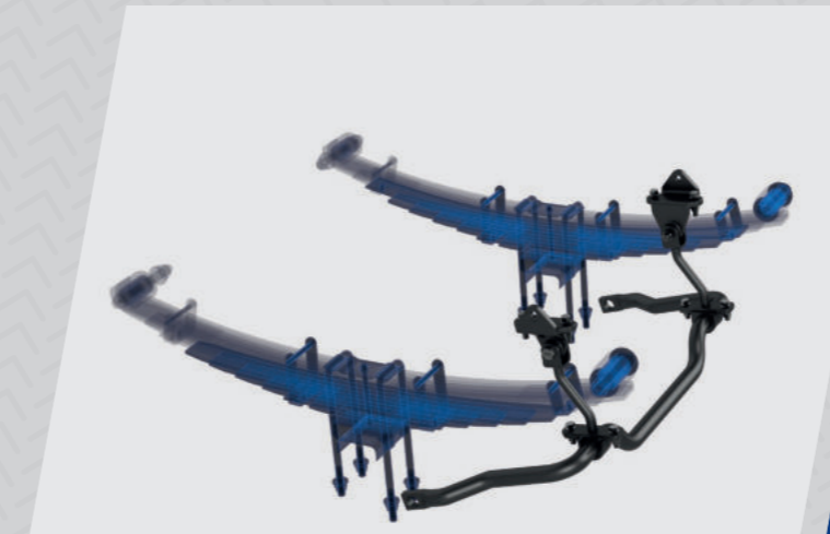
Anti Roll Bar