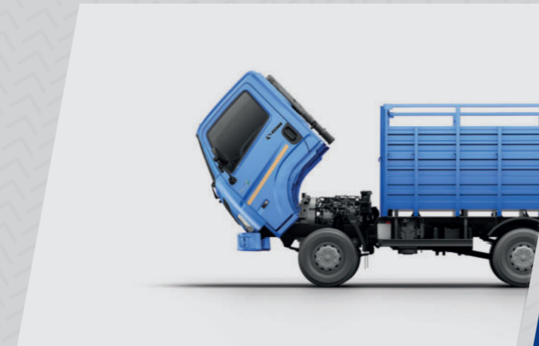
1.8m narrow & tiltable cabin