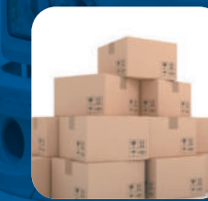
Parcel & Courier

VE COMMERCIAL VEHICLES A VOLVO GROUP AND EICHER MOTORS JOINT VENTURE eichertrucksandbuses.com, Eicher Care: 1800 102 3531