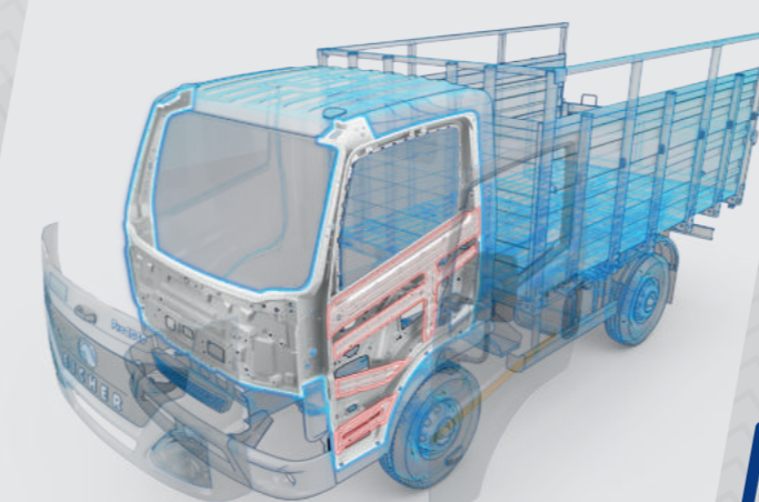
Dual panel cabin