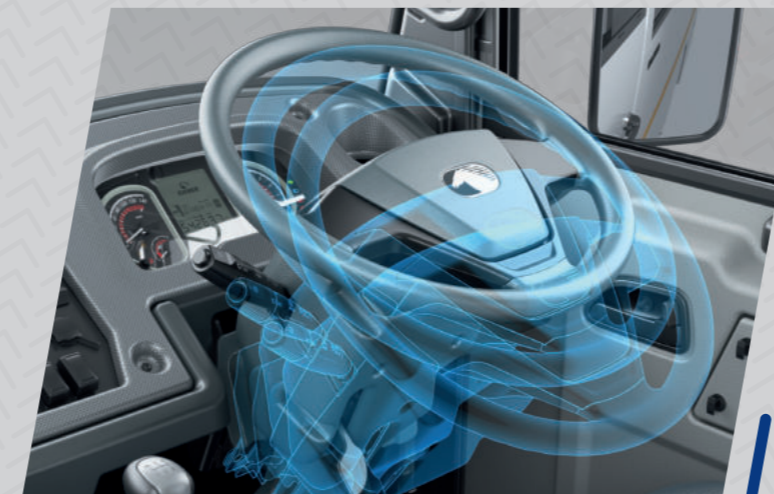
Tilt & telescopic power steering