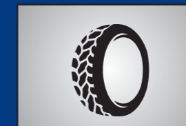
10R20 radial tyres