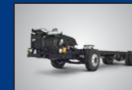
Reliable domex chassis