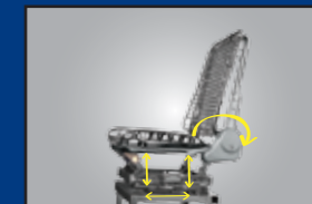
3-way adjustable Driver seat