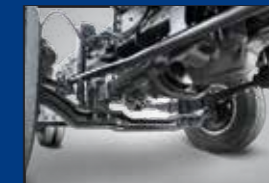
Rear suspension (Wavel standard, air optional)