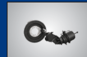
Safer braking with Air brakes