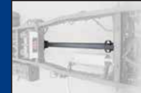
Maintenance free Monotron propeller shaft