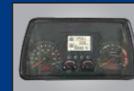
Intelligent driver Information system