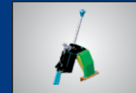
Single rod gearshift lever