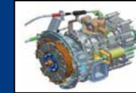
6-speed overdrive gearbox