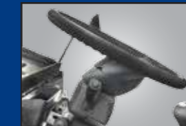
Tilt & telescopic