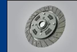
Clutch with 380mm diameter