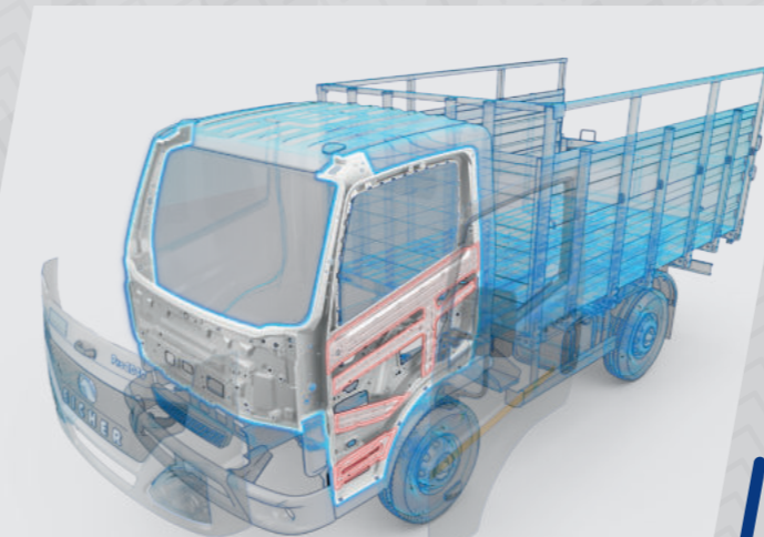
Dual panel cabin