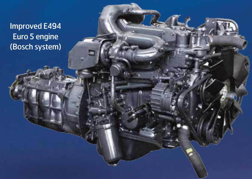
Improved E494 Euro 5 engine (Bosch system)

The new-generation Eicher Skyline Pro 3008 H is built using world-class processes. This bus is equipped with some of the most advanced features to ensure hassle-free rides to commuters.