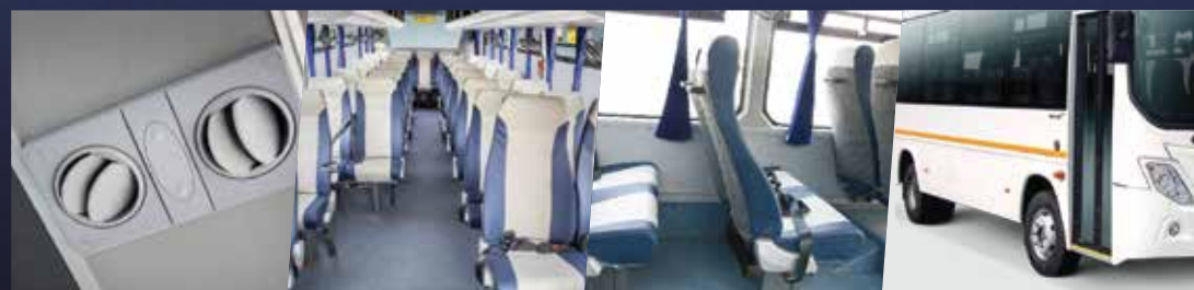
POWERFUL AIR CONDITIONING