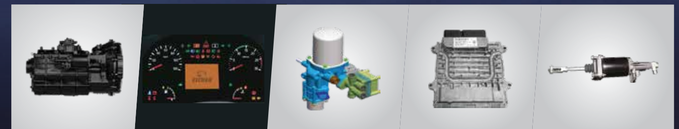
6-SPEED GEARBOX WITH OVERDRIVE