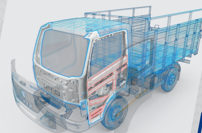
Dual panel cabin