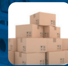
Parcel & Courier

VE COMMERCIAL VEHICLES A VOLVO GROUP AND EICHER MOTORS JOINT VENTURE eichertrucksandbuses.com, Eicher Care: 1800 102 3531