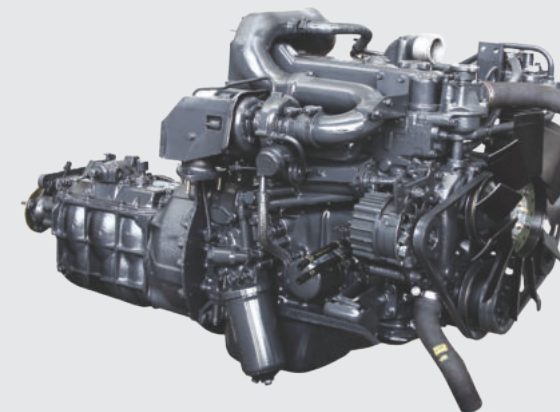
Eicher proven E483 engine

Eicher Pro 2095 provides one with best-in-class mileage and revolutionary driver comfort. Its next-gen technology is ahead of the curve for years to come. The Pro 2095 promises to make your business profitable.