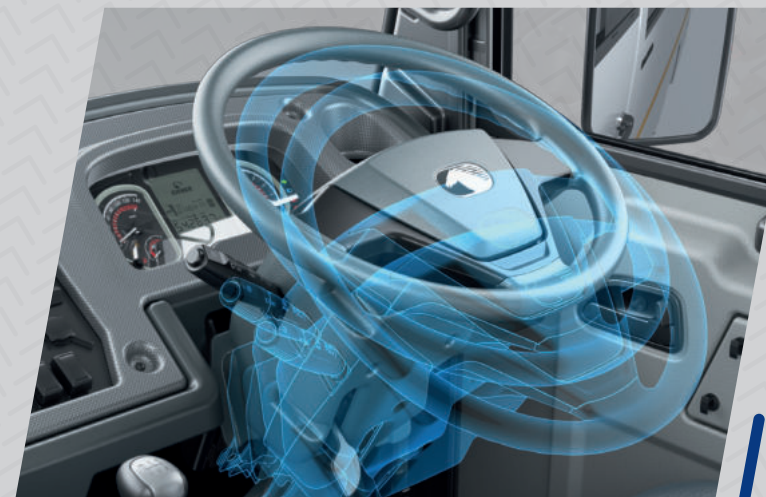
Tilt & telescopic power steering