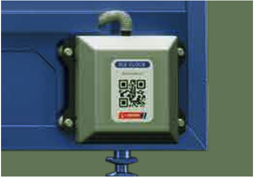
Digital Lock Enhances cargo safety by granting access only to authorised person to open/lock the cargo body