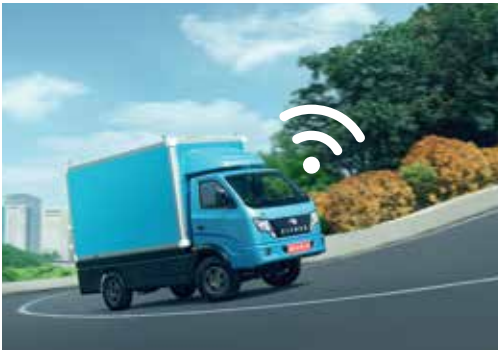
FOTA Telematics Allows remote software updates without visiting the workshop