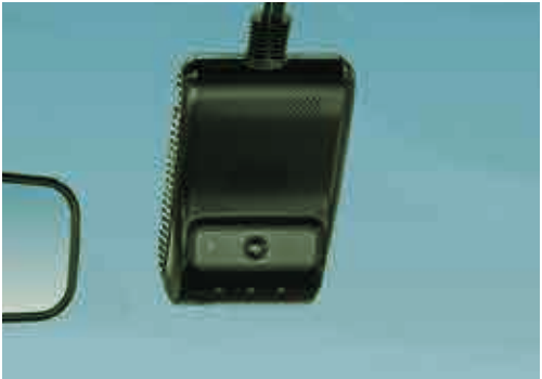
DSMS & Forward Collision Warning Monitors driver's condition & behavior in real time to increase safety